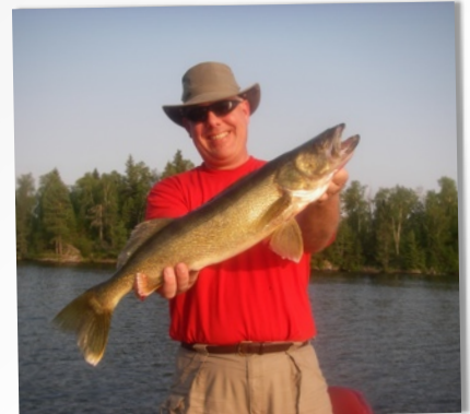
WHAT KIND OF TACKLE?