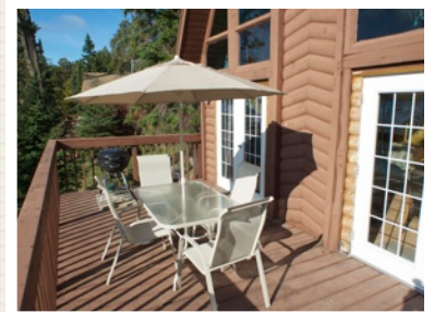
PATIO FURNITURE & BBQ