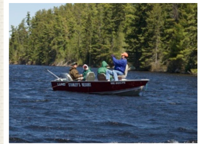
ONE LINE PER ANGLER