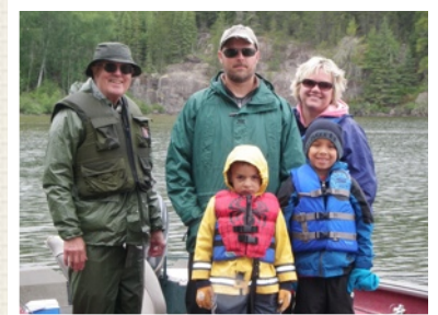
KEEP YOUR FISHING LICENSE AND BOATERS CHECKLIST WITH YOU