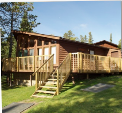
WHAT'S IN THE CABINS?