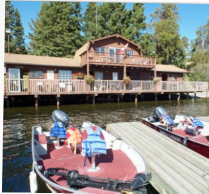
WHAT'S IN THE BOATS?