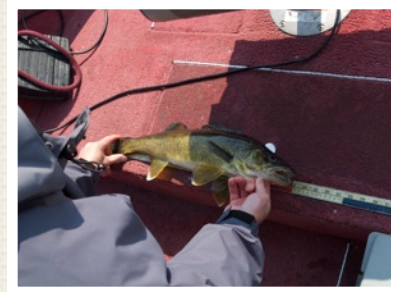
MEASURE EACH FISH