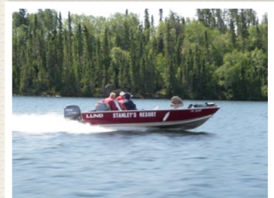
NO ALCOHOL ON THE LAKE