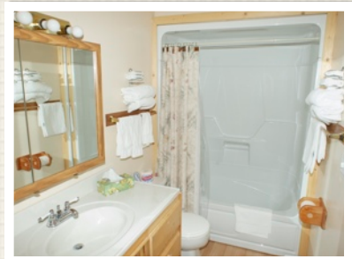
ALL TOWELS AND LINEN