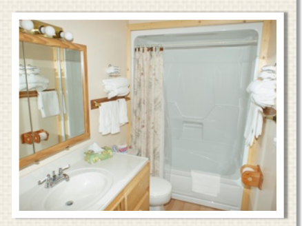
ALL TOWELS AND LINEN