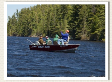
ONE LINE PER ANGLER