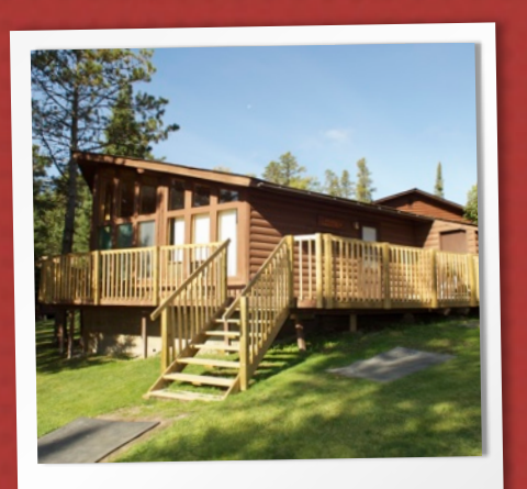
WHAT'S IN THE CABINS?