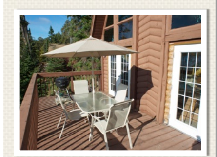
PATIO FURNITURE & BBQ