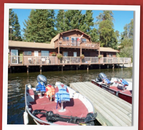
WHAT'S IN THE BOATS?